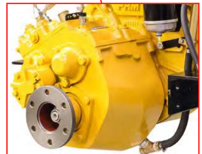
PRM 280 hydraulic gearbox