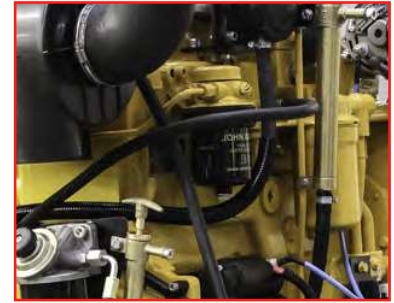
Fuel filter with water drain separator