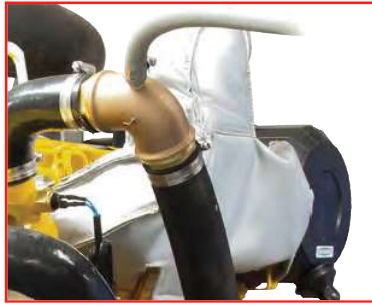
Jacketed dry exhaust manifold